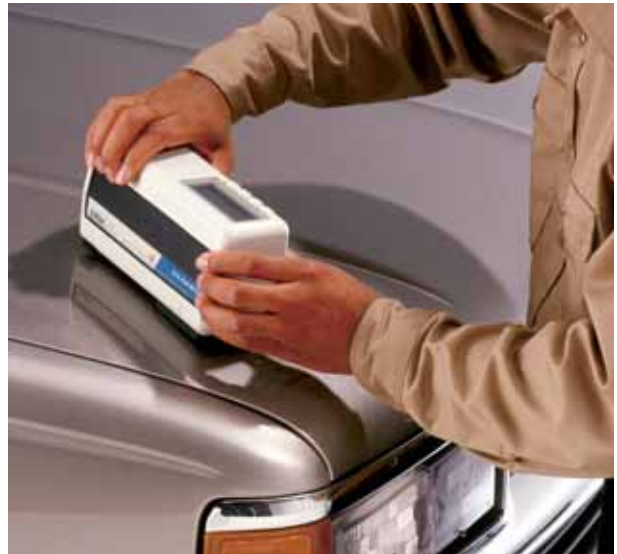
A small sample of the production output can be inspected with manual equipment such as a hand-held spectrophotometer color measurement device.

cant improvement in control and optimization of the paint application process and facilitate troubleshooting of process problems. In turn, improved control over the process will provide benefits such as enhanced paint qual-